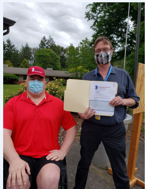
NWPVA funds WIFI for the Washington Soldiers Home-Orting